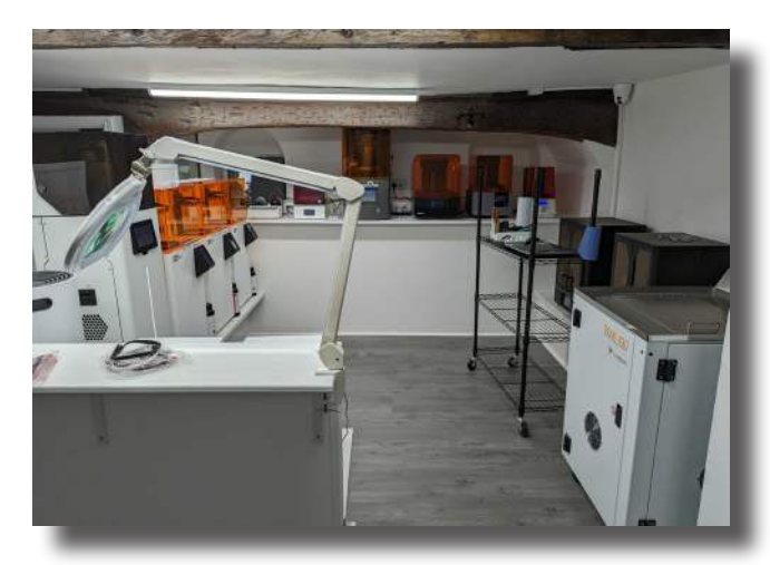
PostProcess® DEMI 430™ showcased in the Nexus Dental Lab

The company is now looking to automate other processes and leverage their skilled team's time for higher-value tasks. The company feels that this is the way forward, especially with tighter regulations with medical devices in the future, and is glad to have made the leap to automation.